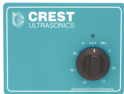
Above: Powersonic Model D digital control of time (0-99 minutes), heat (ambient to 80°C), power level and degas functions. Top Right: Powersonic Model T 0-30 minute timer. Right: Powersonic Model HT 0-30 minute timer and adjustable thermostatically controlled heat (Ambient to 80°C)