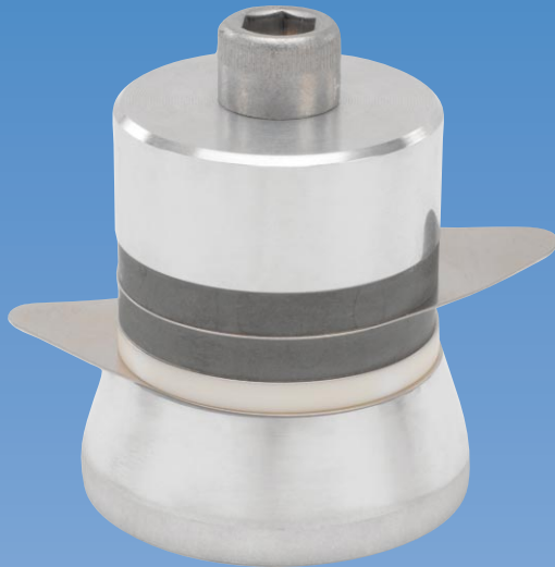
Patented Ceramically Enhanced Transducers

Crest's Powersonic™ rugged industrial strength performance gives you consistent quality at a benchtop price.