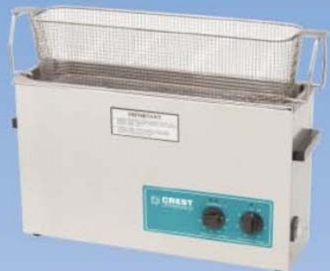
CP 1200 HT with SSMB 1200-DH Mesh Basket with Drain Positioning Handles

* Digital controls not available with CP 200 model