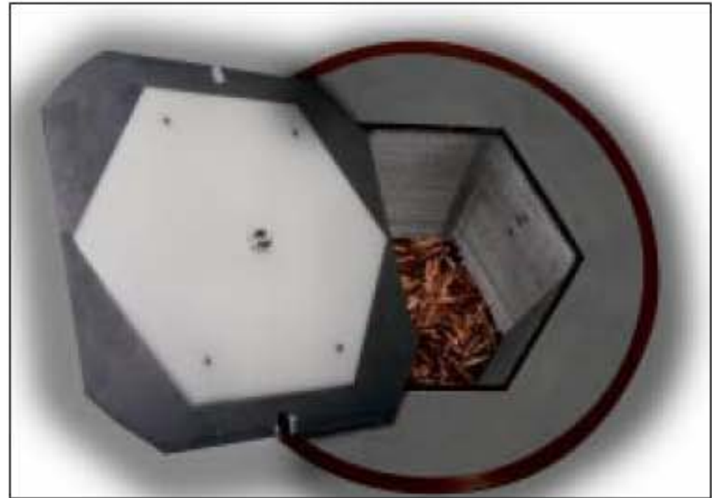
Custom Basket Shapes